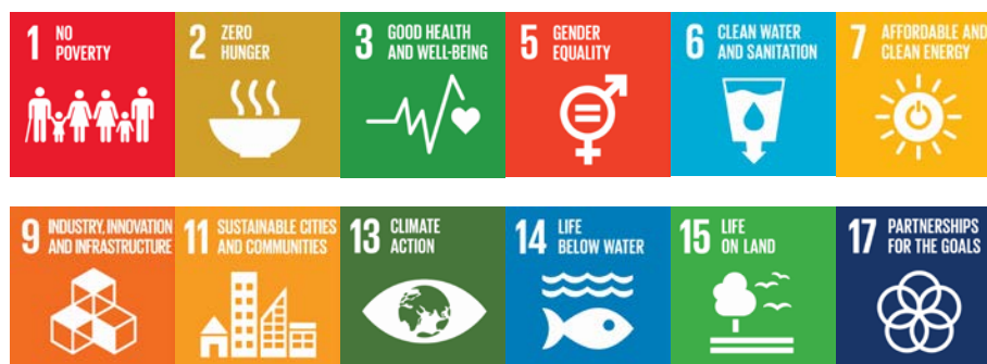
Fig. 1 - WMO contribution to the SDGs