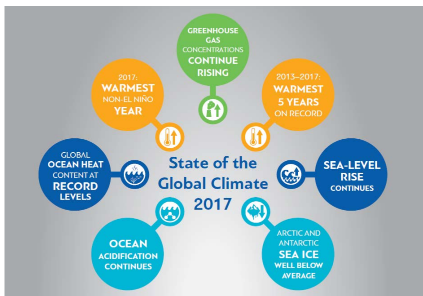
Figure 2- Headline indicators of the climate system as used in the WMO Statement (2017)

The WMO Statement on the State of the Global Climate in 2017, submitted to UNFCCC COP 23 in Bonn, Germany, incorporated additional indicators to describe in a more contextual way how Earth's climate is changing. (Figure 2).