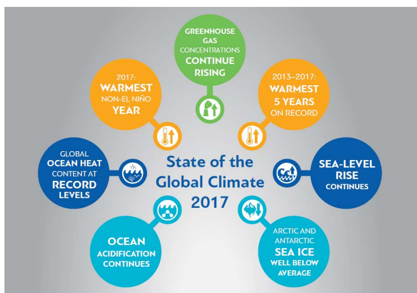
Figure 2- Headline indicators of the climate system as used in the WMO Statement (2017)

The WMO Statement on the State of the Global Climate in 2017, submitted to UNFCCC COP 23 in Bonn, Germany, incorporated additional indicators to describe in a more contextual way how Earth's climate is changing. (Figure 2).